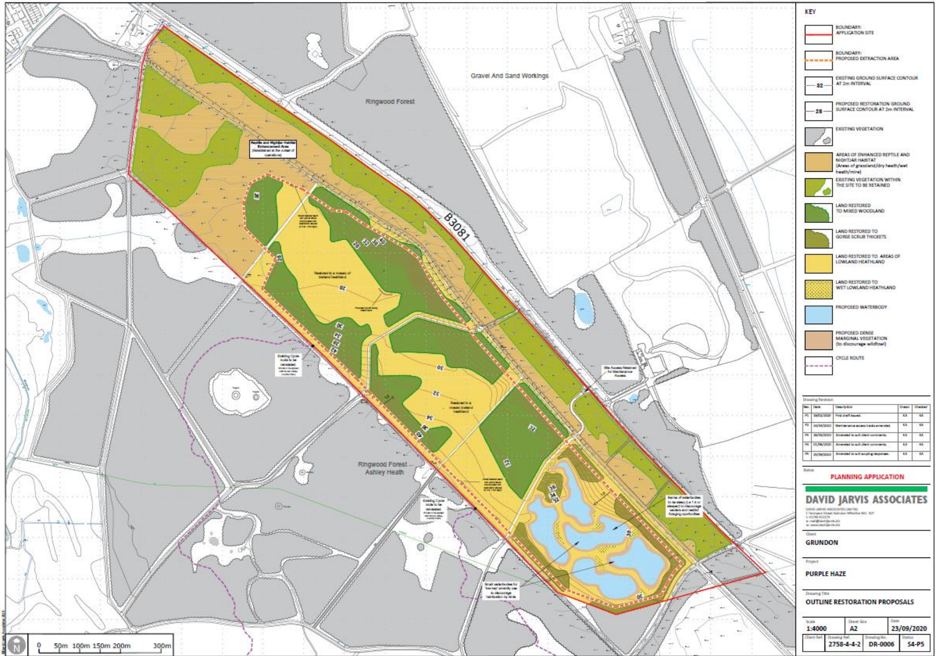
Figure 3: Proposed Restoration